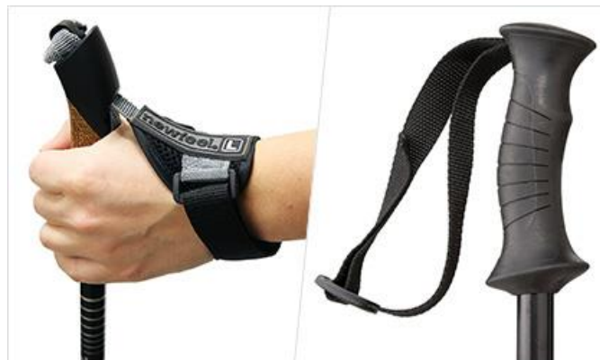
Proper Nordic Style Straps [ ] Trekking or Hiking pole straps

Nordic walking poles are very different from hiking and trekking poles. There's no question; you will receive more benefit when you use proper Nordic straps with your Nordic Poles. For best results, you need the proper equipment. Hiking poles, trekking or walking sticks just don't achieve the same results. Straps increase stability and enable you to be far more flexible.